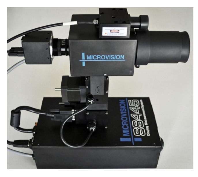
SS445 Shown with CCD Camera and Spectrometer

The SS445 is designed to make measurements of the display from an observer's point of view, thus better representing the display's performance as it is actually seen. Several observer locations can quickly be measured completely defining the display. Testing can be fully automated where the operator enters the desired test locations(X&Y or pixel coordinates) and the system will automatically find and run the selected tests at these locations.